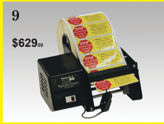
9. Dispensa-Matic "6-II" - for roll or fan-fold labels to 5.5" width. Does not wind up waste, and loads VERY quickly. Better for large diameter rolls, and where constant speed is needed. (6" per second advance.)